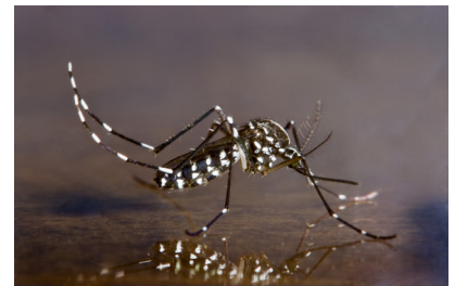
Aedes albopictus (Asian Tiger Mosquito)