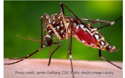
Aedes aegypti (Yellow Fever Mosquito)