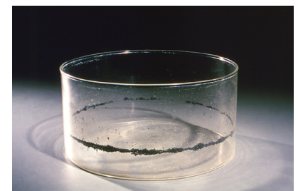
Aedes aegypti mosquito eggs