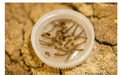
Aedes mosquito larvae and pupae