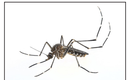
Aedes notoscriptus (Australian Backyard Mosquito)