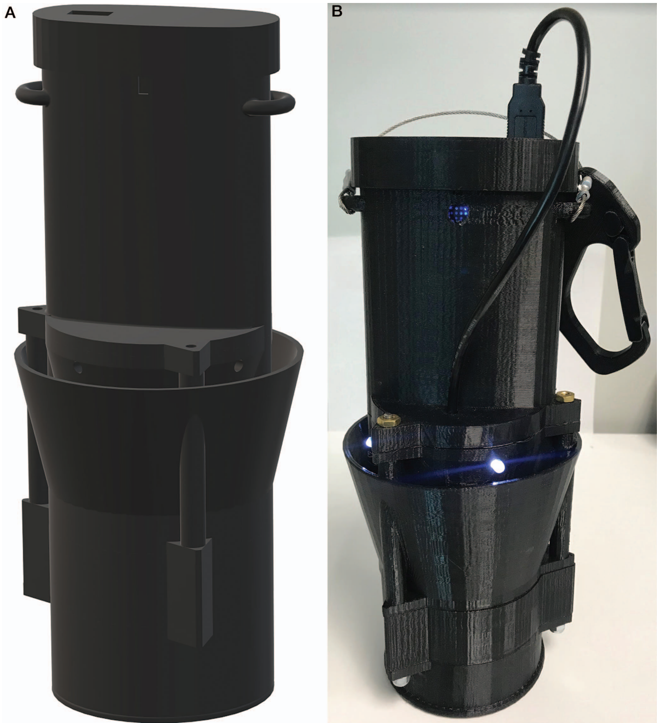
Figure 1.—(A) 3D model of the EVS trap produced using AutoCAD software. (B) Assembled 3D printed EVS trap.